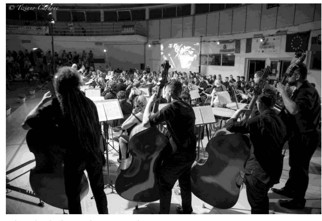
The combined orchestra performing in San Salvo.

The main objectives of the project and trip abroad were to nurture strong links with the organisation in San Salvo, to build on existing friendships and to form new links for future exchanges. It was also a chance to