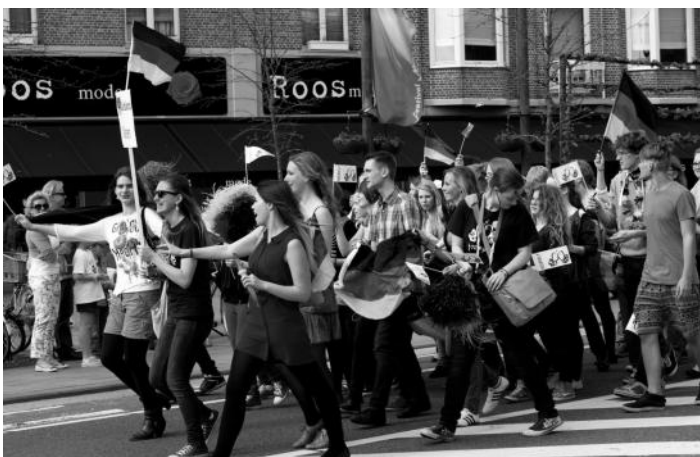
Young German musicians parading through the town of Neerpelt

To find out more about the festival in Neerpelt, visit www.emj.be - if you arrive at the Dutch language site, click EN for the English site. You can get a full guide to the festival events and also watch video footage to see and hear what to expect.