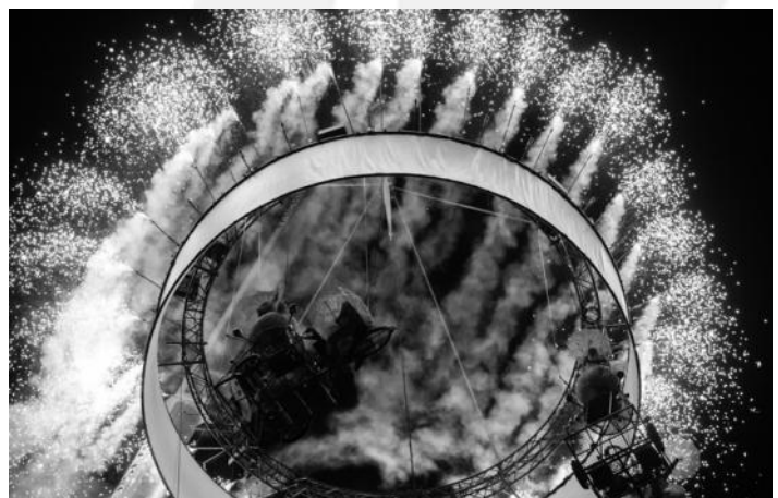
The spectacular sky-high antics of the Theatre Tol ariel show!